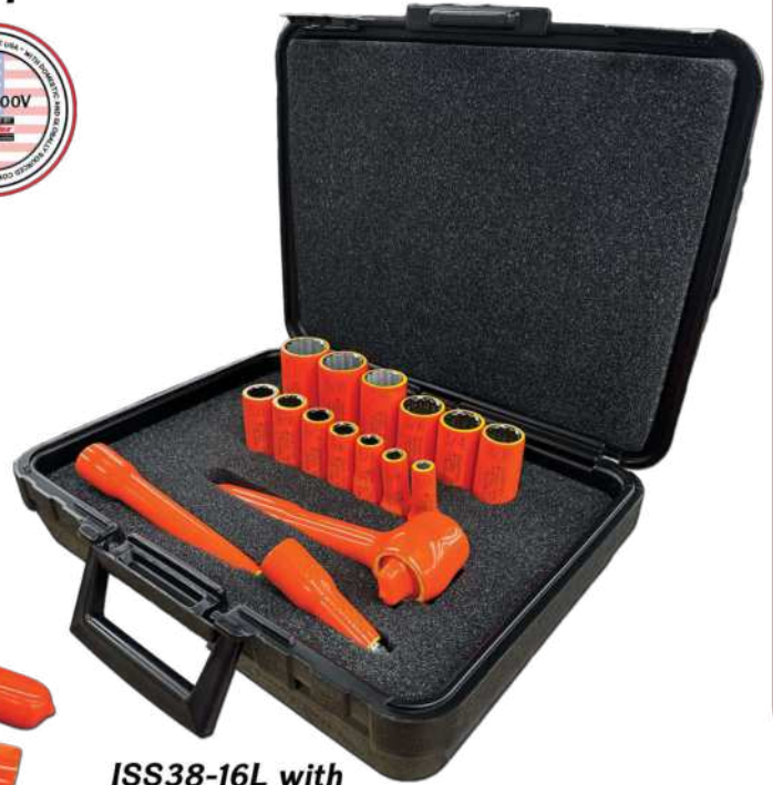
ISS38-16L with Blow Molded Case Large