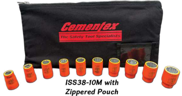
ISS38-10M with Zippered Pouch