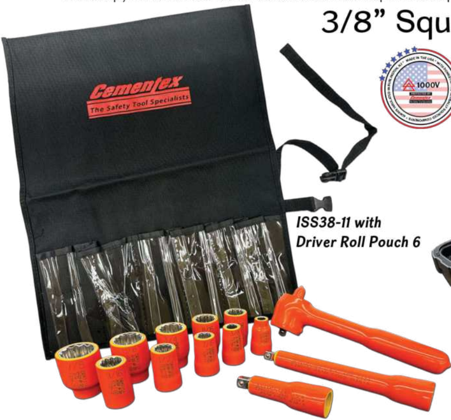
ISS38-11 with Driver Roll Pouch 6