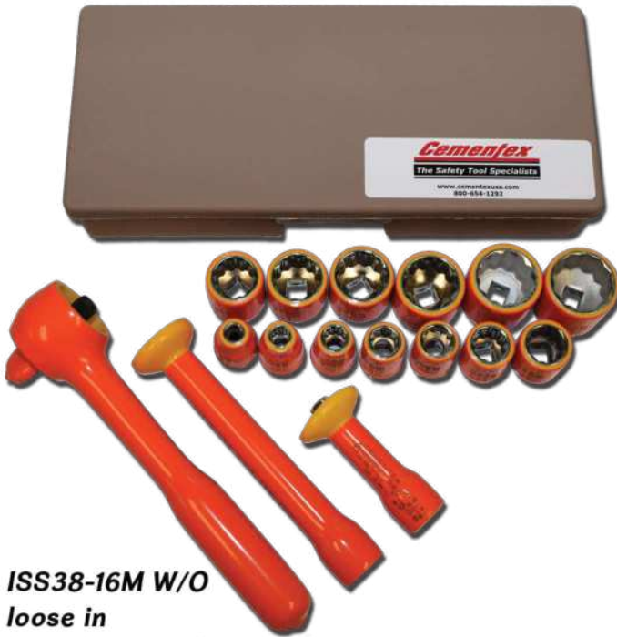
ISS38-16M W/O loose in Snap Closure Case 501