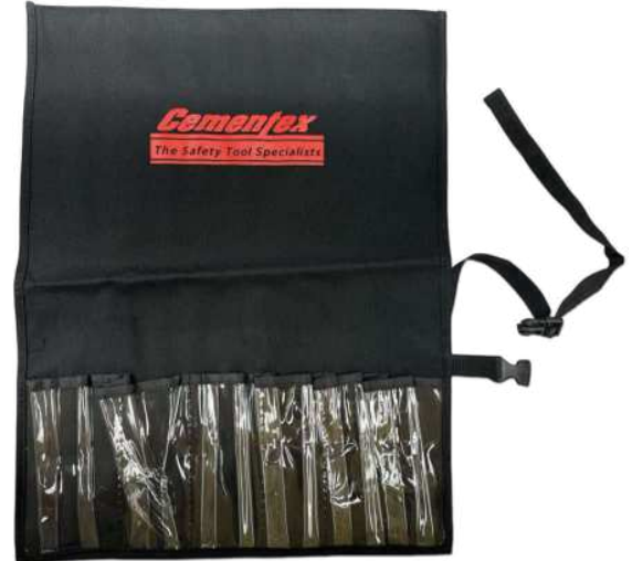
Driver Roll Pouch 6